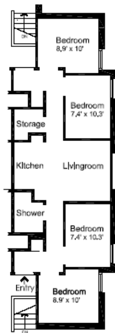
Four Bedroom Tower

For more pictures and information about Residence, please check us out online at www.rdc.ab.ca/residence