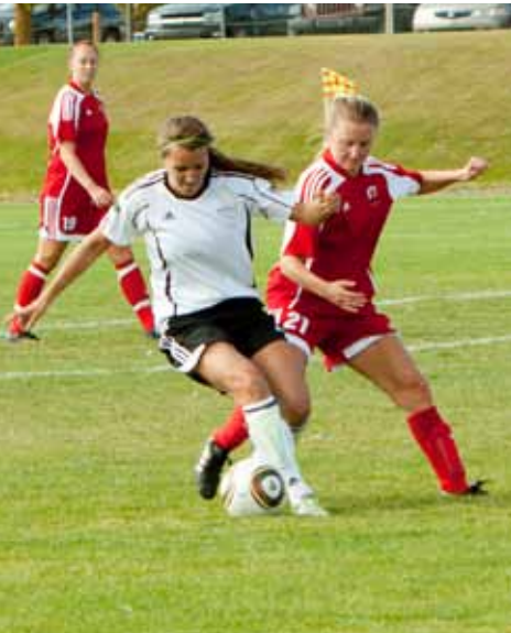
Stop Action Photography - Tony Hansen